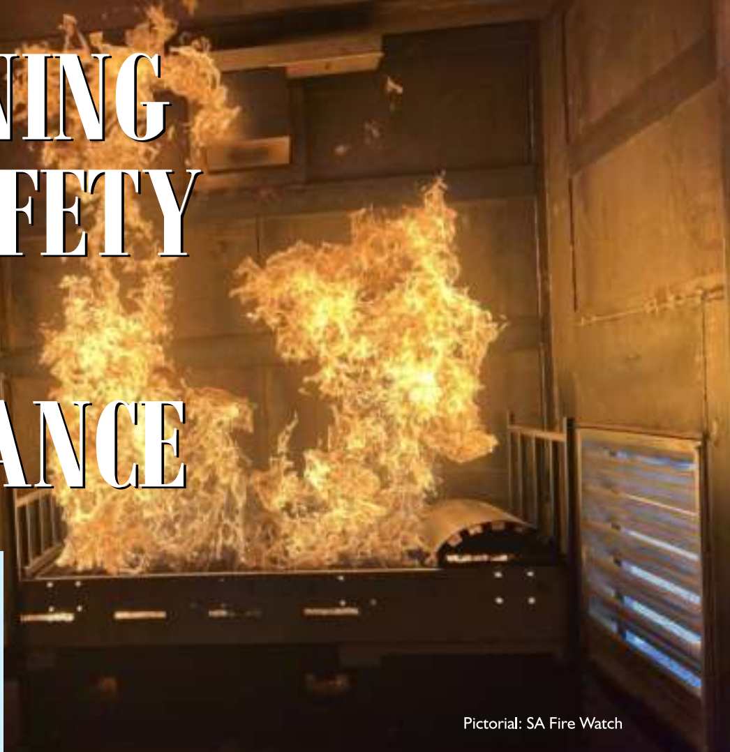
Pictorial: SA Fire Watch

We here at SA Fire, are charting a new course in the realm of emergency preparedness, but also deeply versed in health and safety protocol which is a cornerstone of building occupancy compliance.